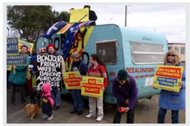
We're not going anywhere: More than 100 Watershed supporters gathered near the desalination site last month to protest at the State Government's announcement of the multi-national consortium AquaSure to build and manage the project. The famous blue Your Water Your Say caravan was pulled out of retirement to mark the occasion. Speakers made it clear the campaign would go on.

not compliant. We are not too hopeful of a better result now that the AquaSure consortium is in charge – the need for haste, disturbance of acid sulphate soils and waste silt flowing into the Powlett River are some of the many conditions likely to cause problems.